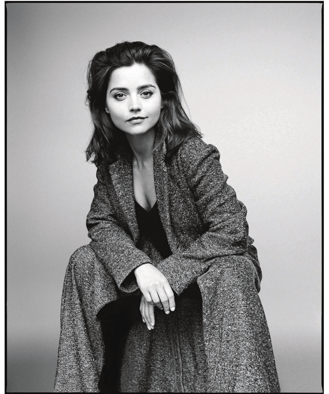
Grey tweed coat Polo Ralph Lauren; black cotton body Intimissimi; black silk trousers Calvin Klein Collection

Born in Blackpool in 1986, Jenna started her screen career in Yorkshire-set soap Emmerdale . Until now, though, she has been best known as Doctor Who companion Clara, alongside Doctors Matt Smith and Peter Capaldi. She battled monsters in the coveted BBC role for three years and left in 2015. It was a wrench ►