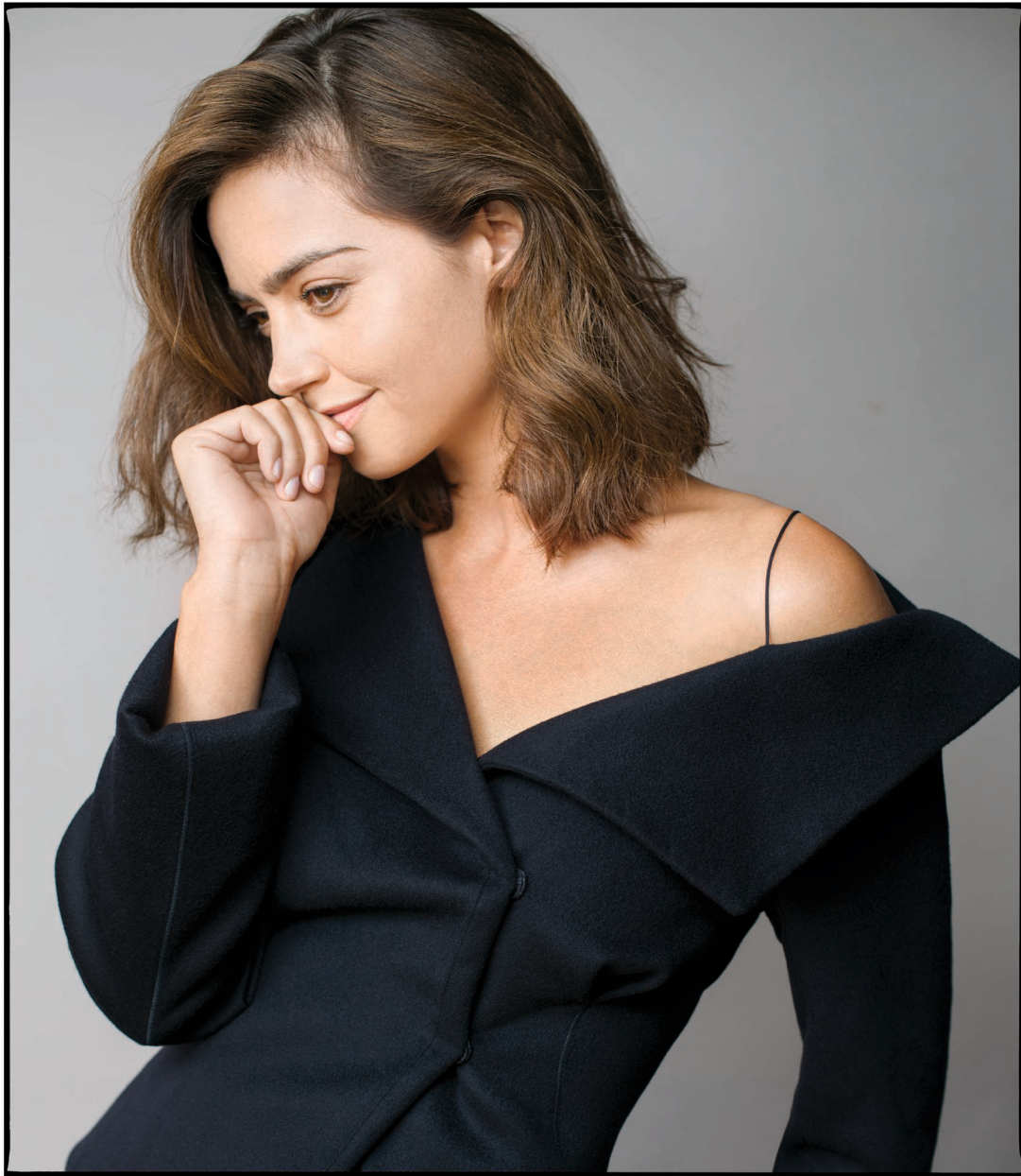
Wool jacket Dior