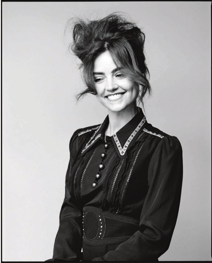
This page Black silk dress Coach. Opposite page Cotton dress Miu Miu